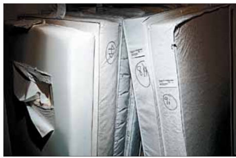
A Chicago lab extracted foam from baby mattresses and tested it for flame retardants identified as a cancer risk.